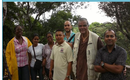
BOARD OF DIRECTORS AT CANOPY WALKWAY, ATTA LODGE, RUPUNUNI.