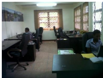
INTERNAL VIEW OF PAC OFFICE

The National Parks Commission building was identified to house the offices of the PAC. It was refurbished and extended in order to accommodate staff of the PAC. This project was executed by the EPA under Phase II of the GPAS Project, with support from the PAC. This activity was paired with an assessment and cost estimate for the installation of a photovoltaic system by engineers from the Guyana Energy Agency.