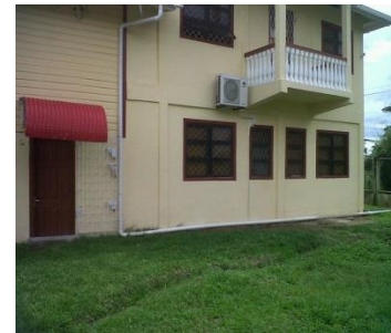
REFURBISHED SECTION OCCUPIED BY PAC